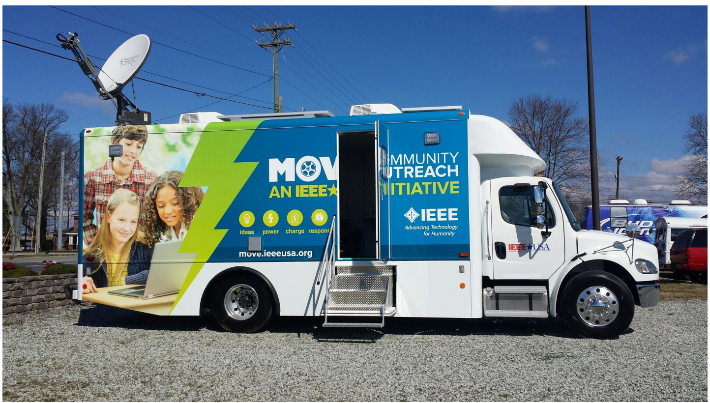
The MOVE truck

As these are section projects and are run by section